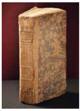
First edition of Quadrupeds in its original publisher's boards — as it appears now, 222 years later.